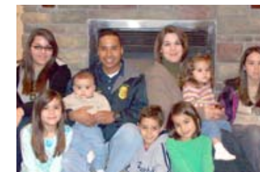
Warner Family Fort Drum, NY

"Our Family takes a lot of pride in recycling and energy conservation. We keep lights out when not in use, run the dishwasher only when full, and unplug items not in use such as the coffee pot and cell phone charger. We are a large Family and think conserving energy and recycling is of the utmost importance and easily attainable. We are consistently below the allotted amount, so it's not hard at all to be environmentally friendly."